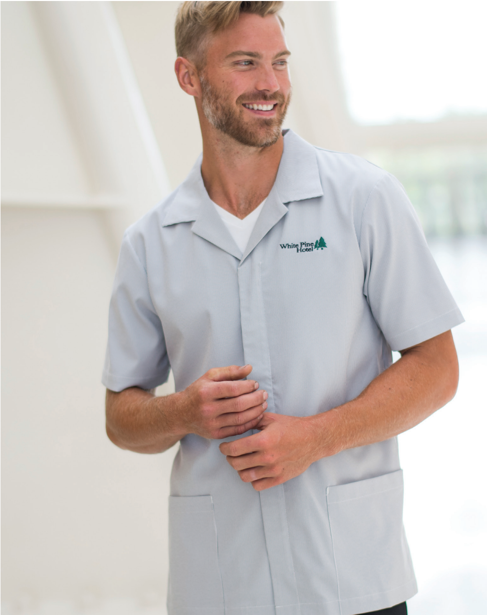
4282 Men's Service Shirt