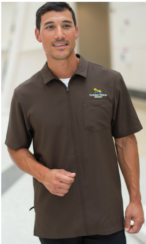
4284 Men's Service Shirt