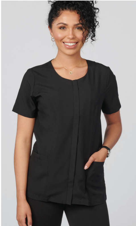
7284 Ladies' Scoop Neck Tunic