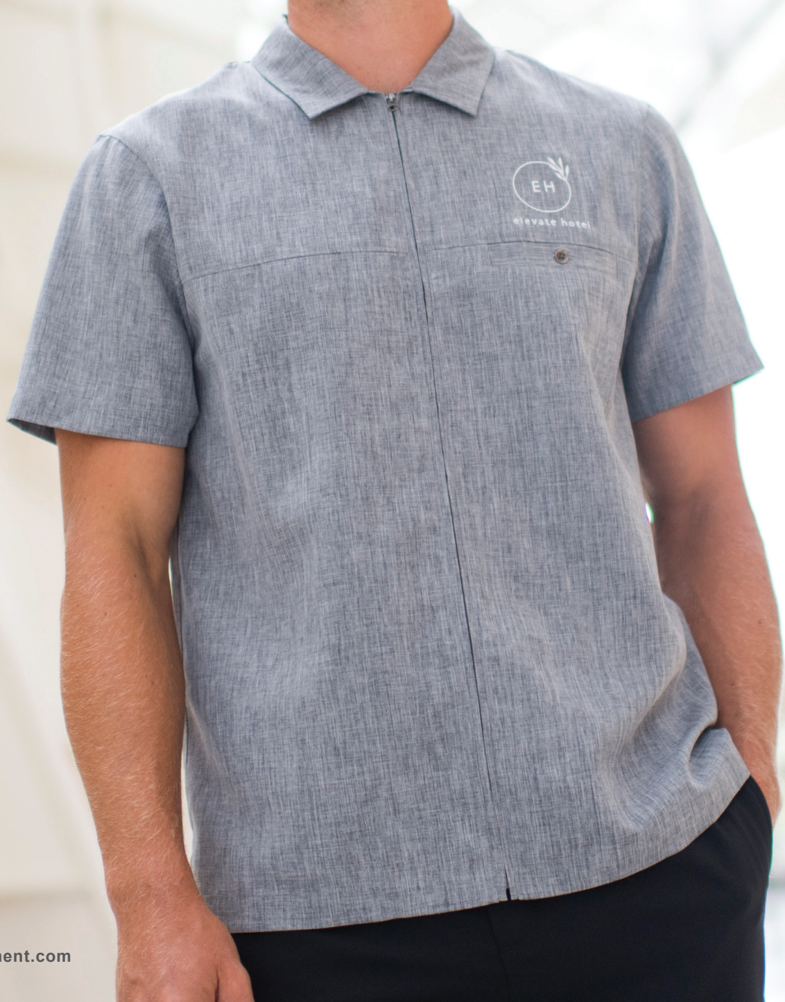
4281 Men's Service Shirt