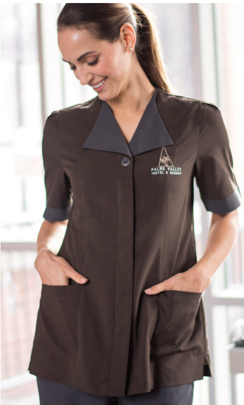
7280 Ladies' Tunic

010 Black/Flax, 013 Burgundy/Black, 079 Steel Grey/Platinum, 138 Chocolate/Steel Grey, 406 Riviera Blue, 901 Platinum/Black