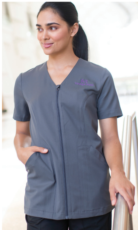
7260 Ladies' Tunic