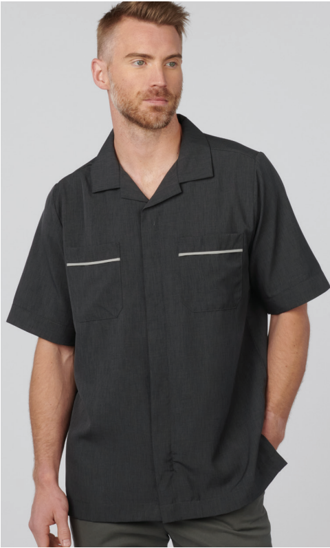
4280 Men's Service Shirt