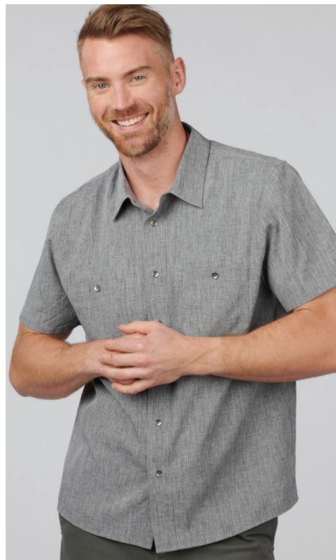
1039 Men's Melange Camp Shirt