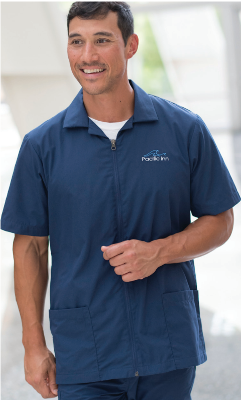
4891 Men's Service Shirt