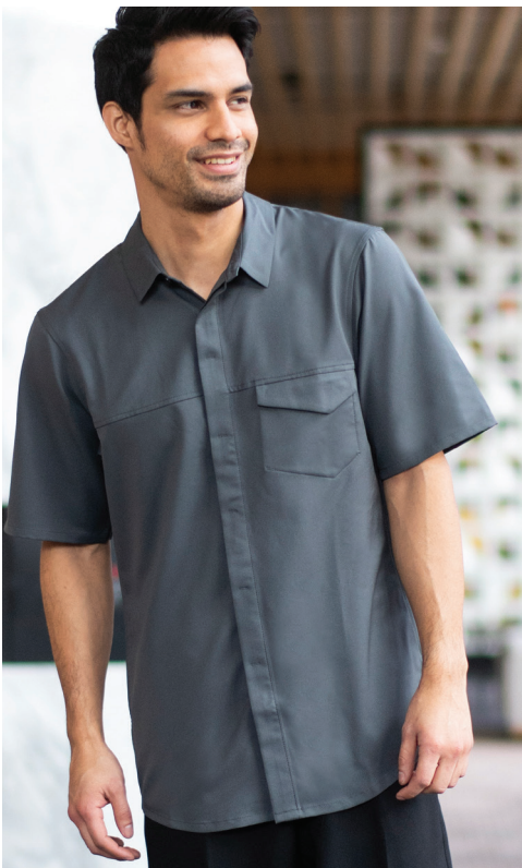
4283 Men's Tech Shirt