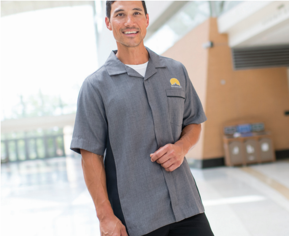
4890 Men's Service Shirt