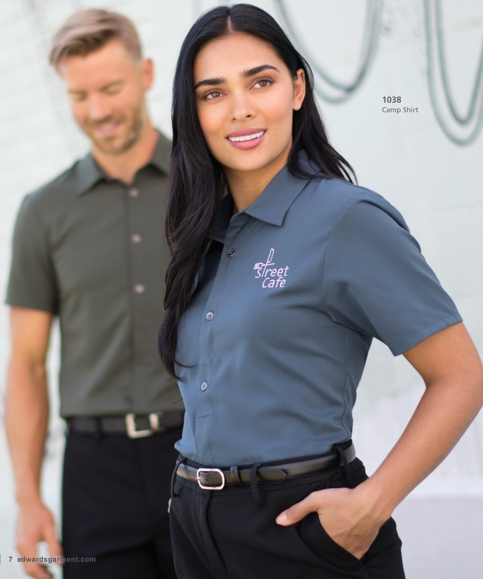
1038 Camp Shirt