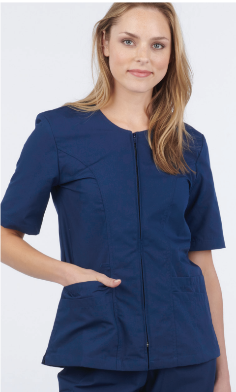
7887 Ladies' Zip-Front Smock