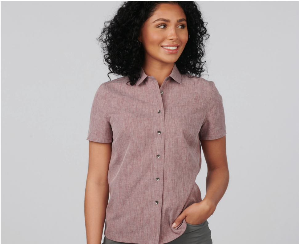
5041 Ladies' Melange Camp Shirt