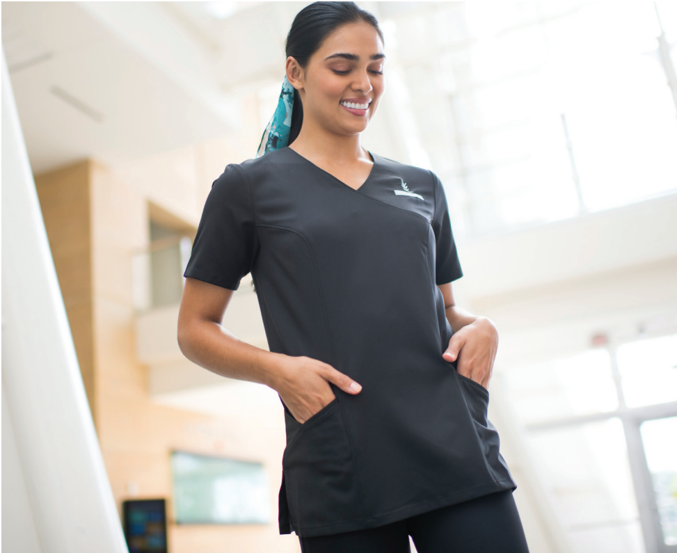
7283 Ladies' Faux Wrap Tunic