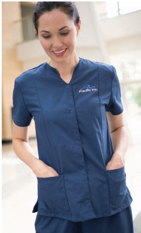
7889 Ladies' Snap-Front Smock