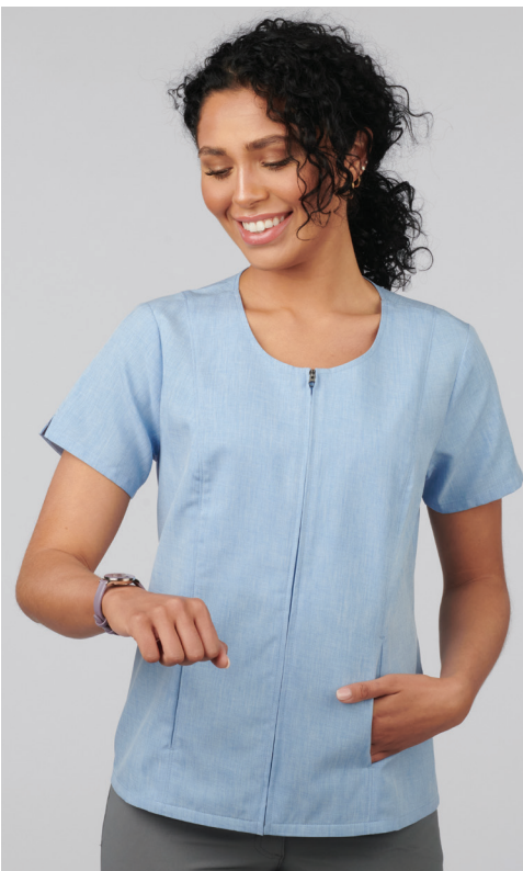
7279 Ladies' Tunic