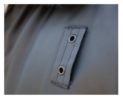
Badge tab with metal eyelets.