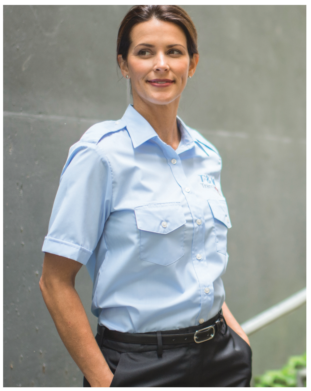
1212 Men's / 5212 Ladies' Short-Sleeve Shirt