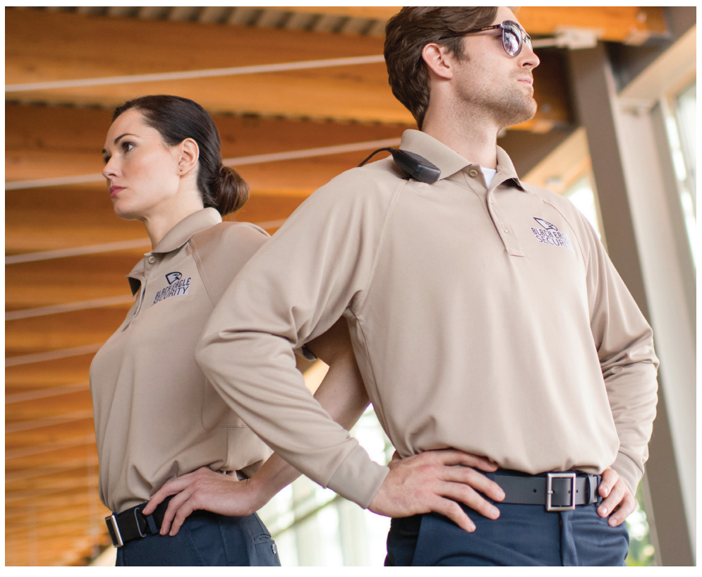
1567 Long-Sleeve Polo