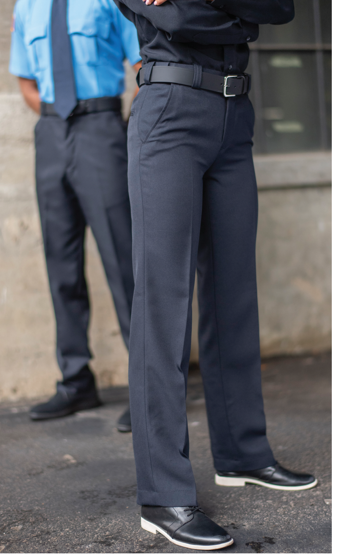
2596 Men's / 8596 Ladies' Pant