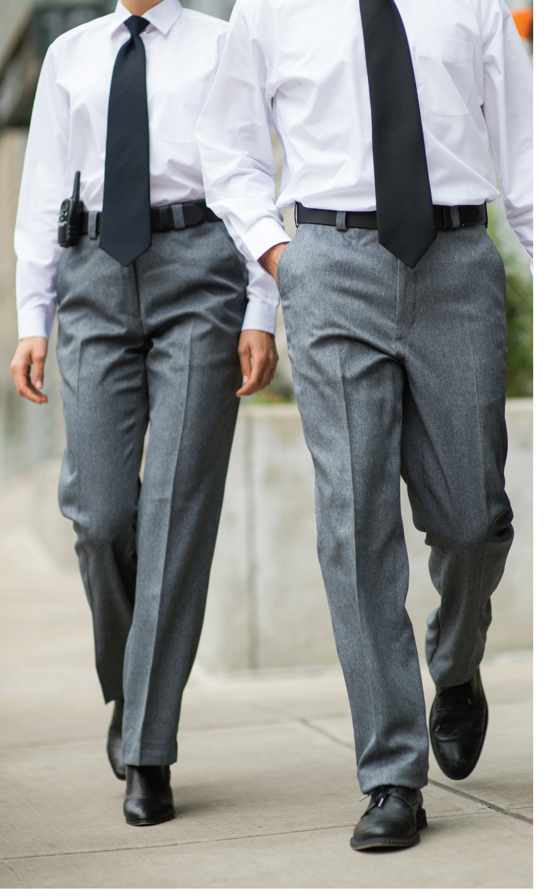
2595 Men's / 8591 Ladies' Flat-Front Pant