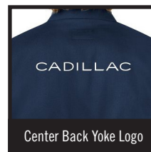
Center Back Yoke Logo

Bulwark® Protective Apparel offers flame-resistant protective garments that are certified by Underwriters Laboratories to meet the requirements of NFPA® 2112 Standard on Flame Resistant Garments for Protection of Industrial Personnel Against Flash Fire, 2018 Edition. NFPA® 2113 Standard on Selection, Care, Use and Maintenance of Flame Resistant Garments for Protection of Industrial Personnel Against Flash Fire, 2015 Edition, requires that garments cover the upper and lower body and flammable underlayers as completely as possible. Bulwark® garments meet this requirement either as a single garment such as a coverall or when worn with another certified garment such as a shirt or pants to provide both upper and lower body coverage.