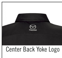
Center Back Yoke Logo