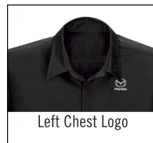
Left Chest Logo