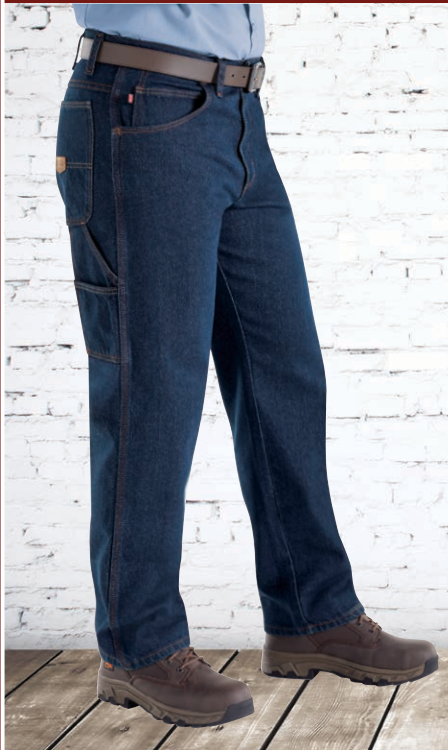
PD80 - Carpenter Styling