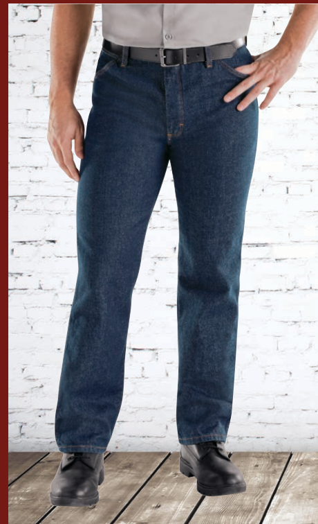
PD54 - Western Styling