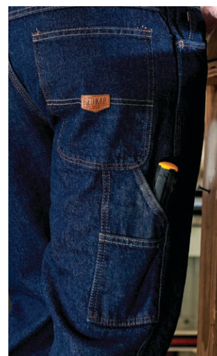
Double rule pocket