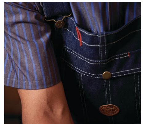
Snap bib pocket