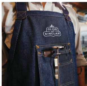
Hanging top pocket