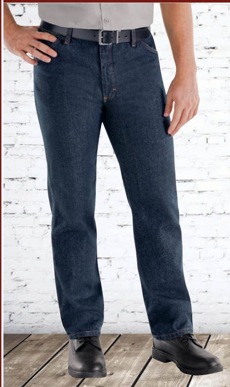
PD52 - Western Styling