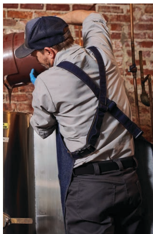
Adjustable suspender back with side buckle