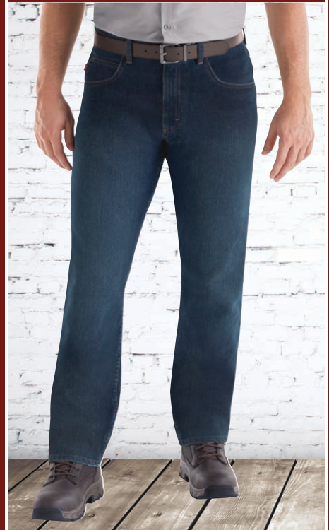
PD90 - 5-Pocket Styling