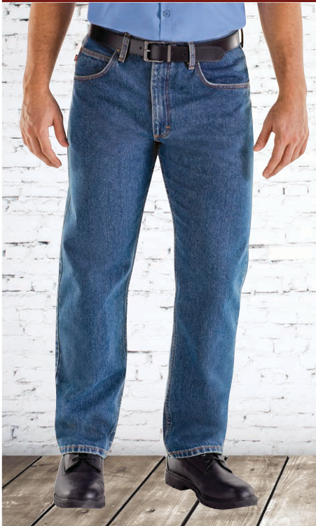
PD60 - 5-Pocket Styling